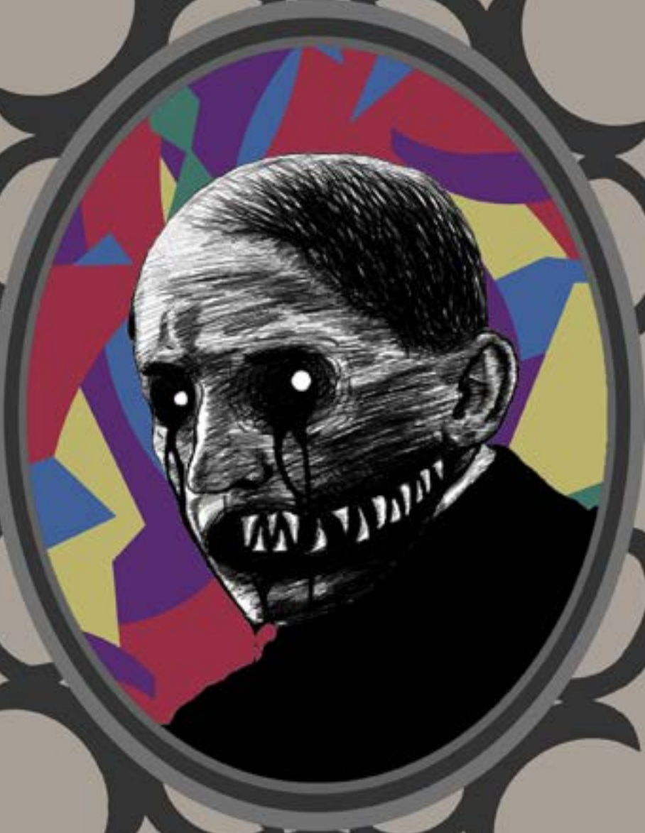
Umberto Boccioni Died - 1916

I'm so HUNGRY... I haven't had sustenance in DECADES!