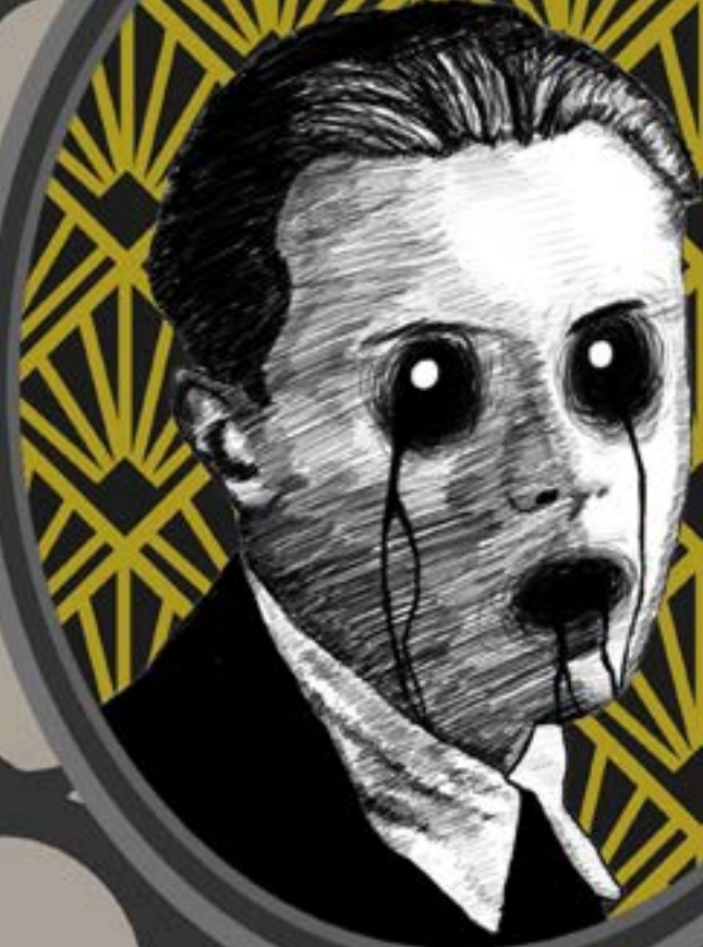
Erté Died - 1990

Now here I have the famed "Erte", who was a French artist and designer in an array of fields, including fashion, jewellery, graphic arts, costume and set design for film, theatre, opera and interior decor. Over the course of his lifetime, he said that he had created over 17,000 artworks. He was from the Art Deco art movement