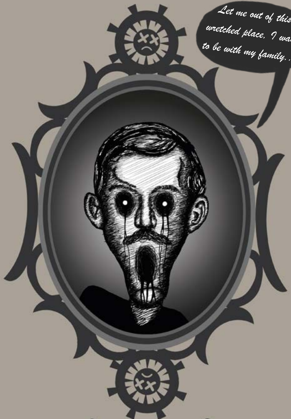
Edvard Munch Died - 1944