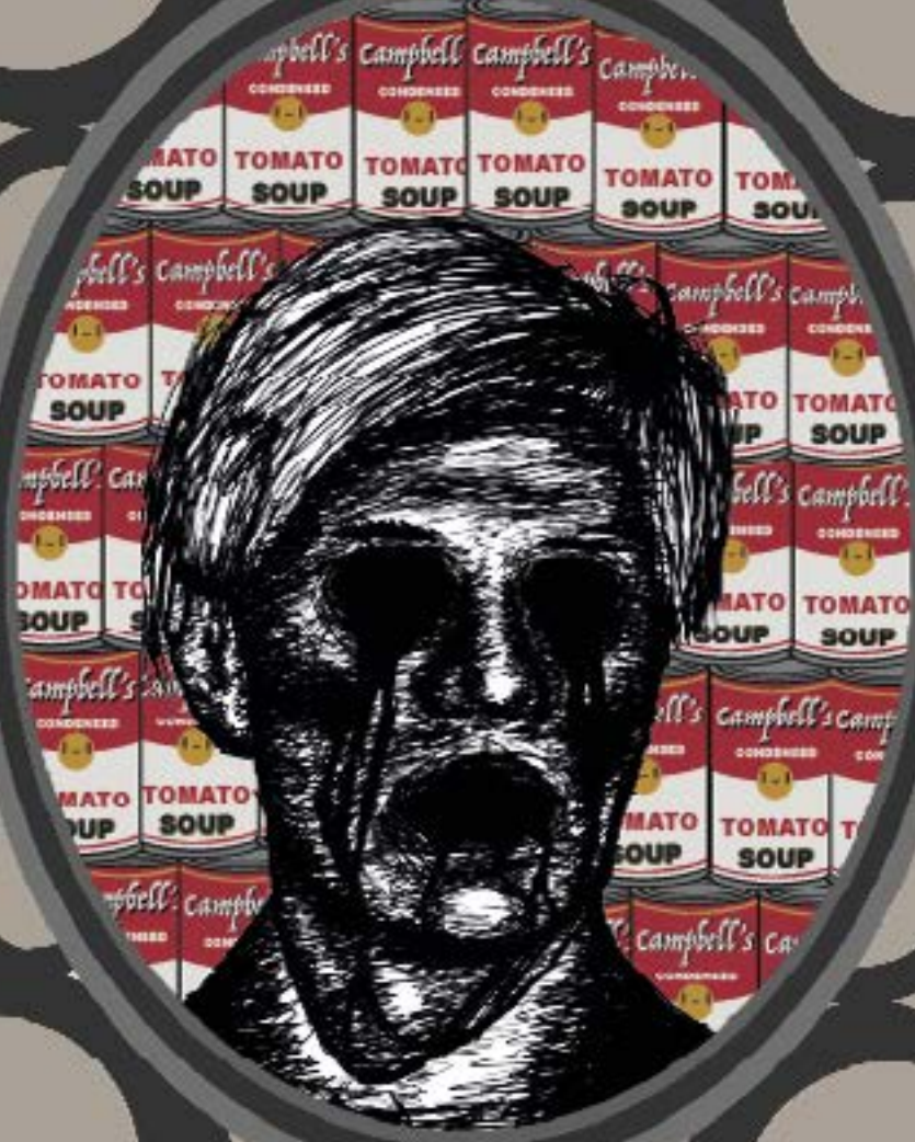
Andy Warhol Died - 1987