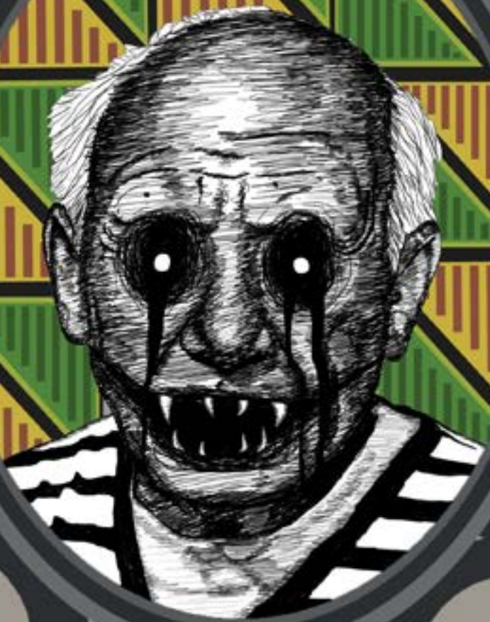
Pablo Picasso Died - 1973