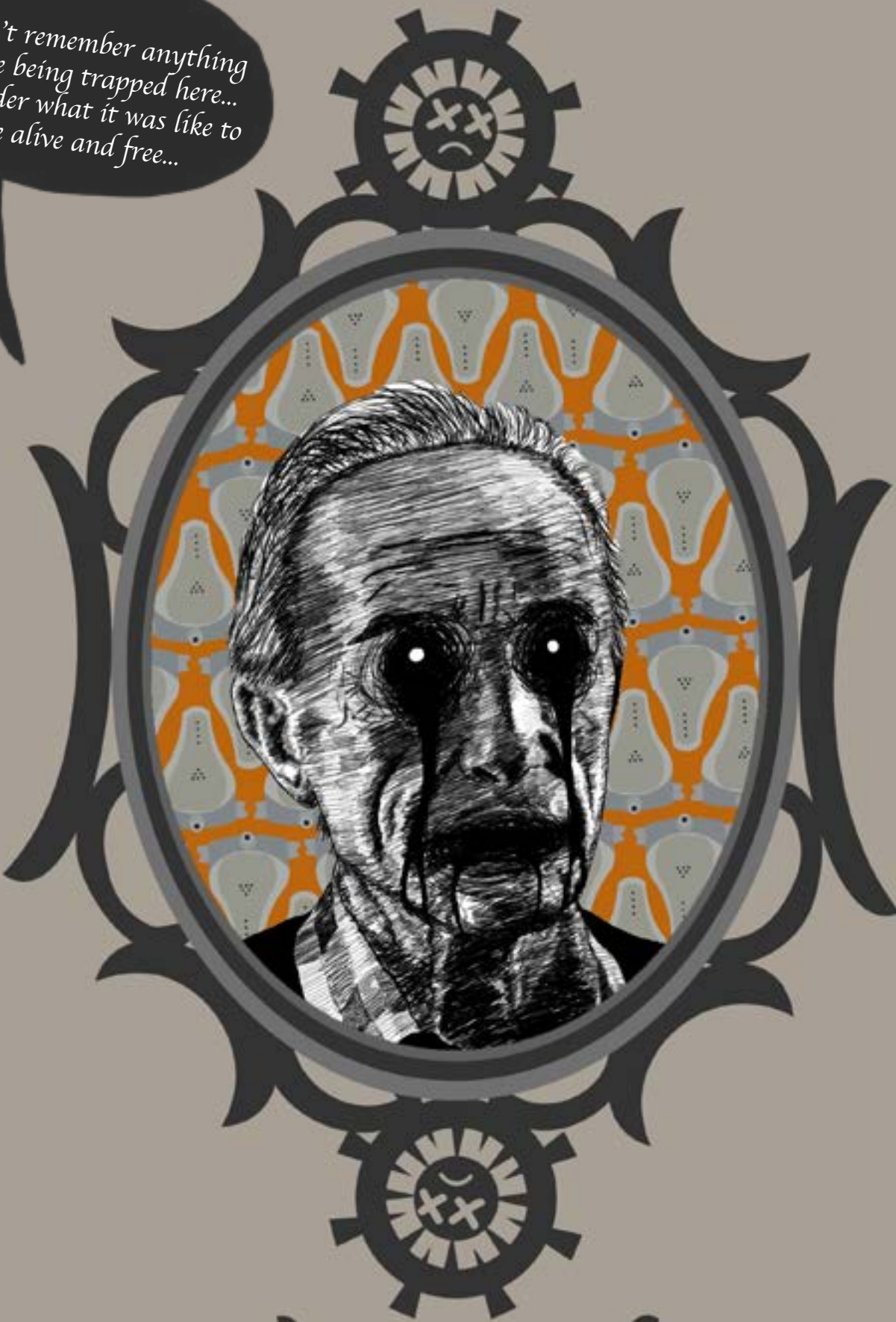
Marcel Duchamp Died - 1968