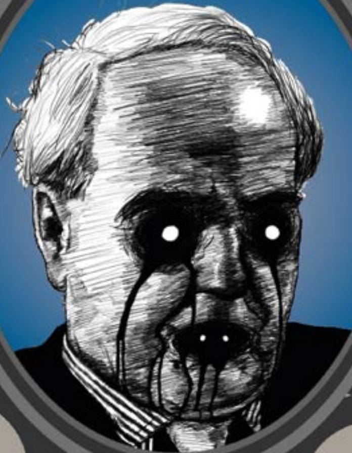
Henry Moore Died - 1986